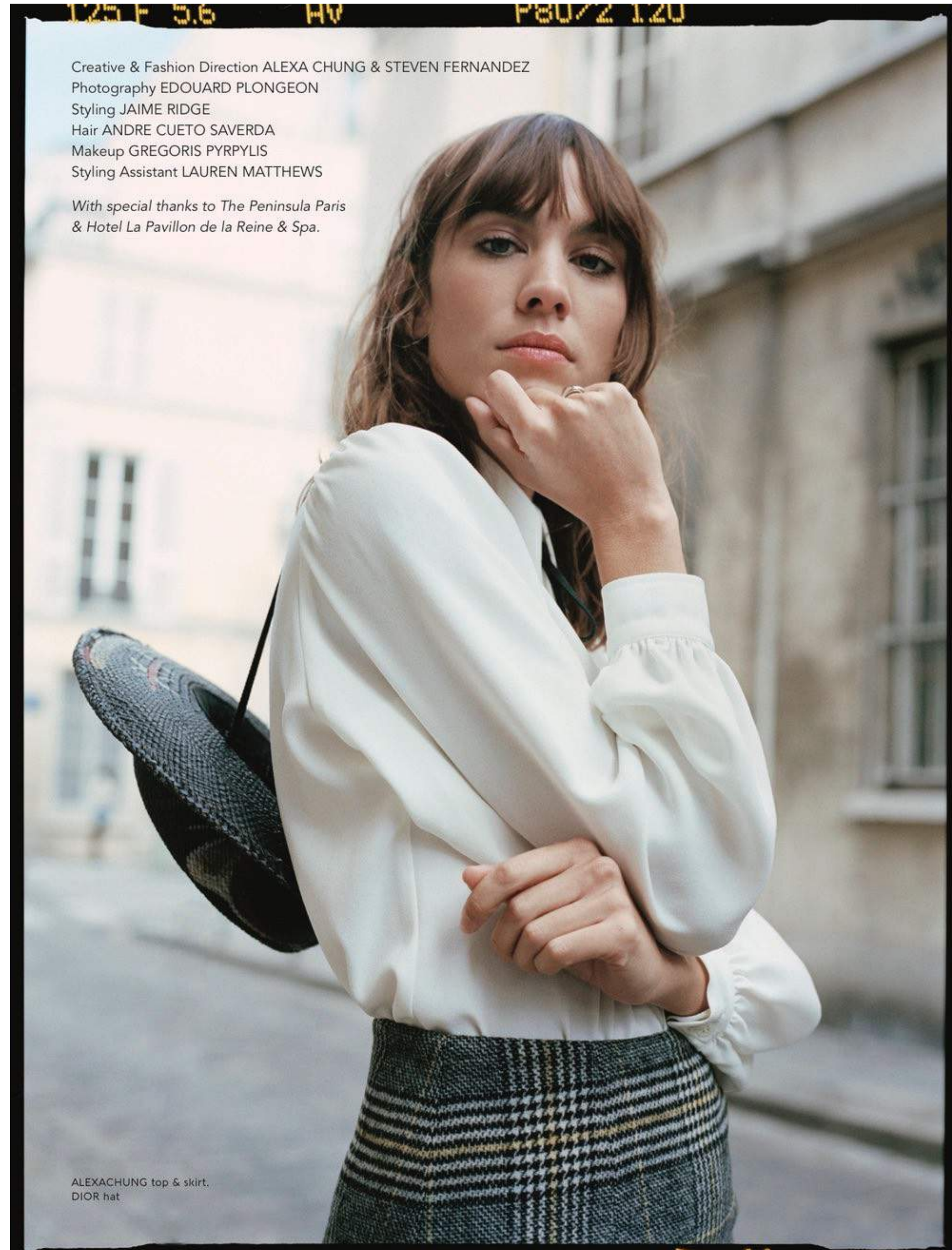
ALEXACHUNG top & skirt. DIOR hat

With special thanks to The Peninsula Paris & Hotel La Pavillon de la Reine & Spa.