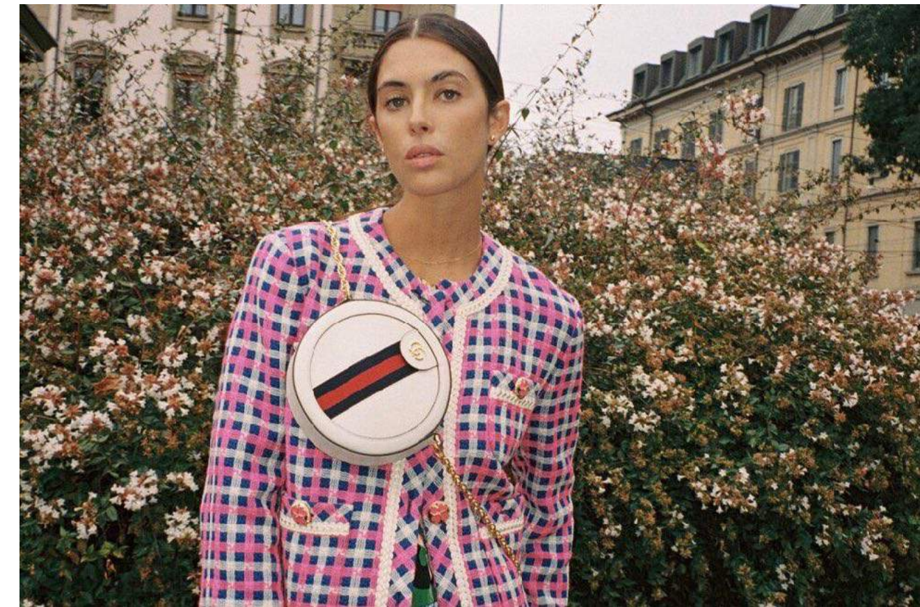
MILAN, SEPTEMBER 2019 BESPOKE CONTENT CREATION